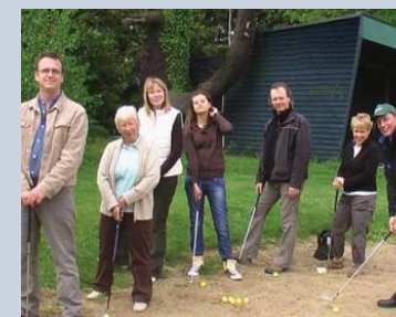
Mastering the art of looking nonchalant in the bunker is a top priority.